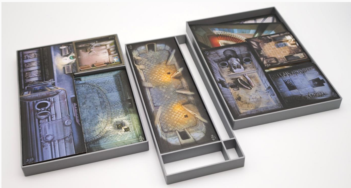
3 boxes for double sided tiles sized 1x1, 2x1, 2x2, 3x1, 3x2 and I-shaped tiles