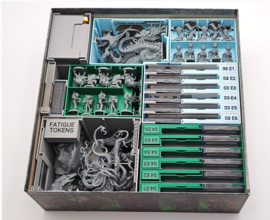
Layout of the game box (without tiles, game manuals)